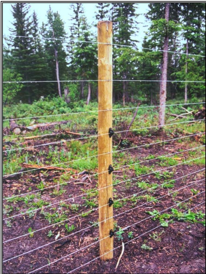
Figure 1 Typical Elk Line Fence Showing Line Post, Wire and Insulators