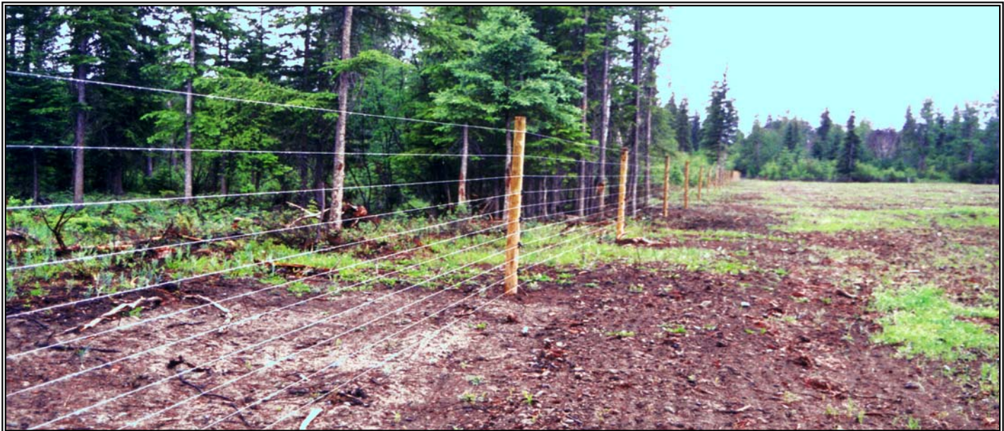
Figure 4 New Cropland with New Electric Elk Fence in East Kootenays