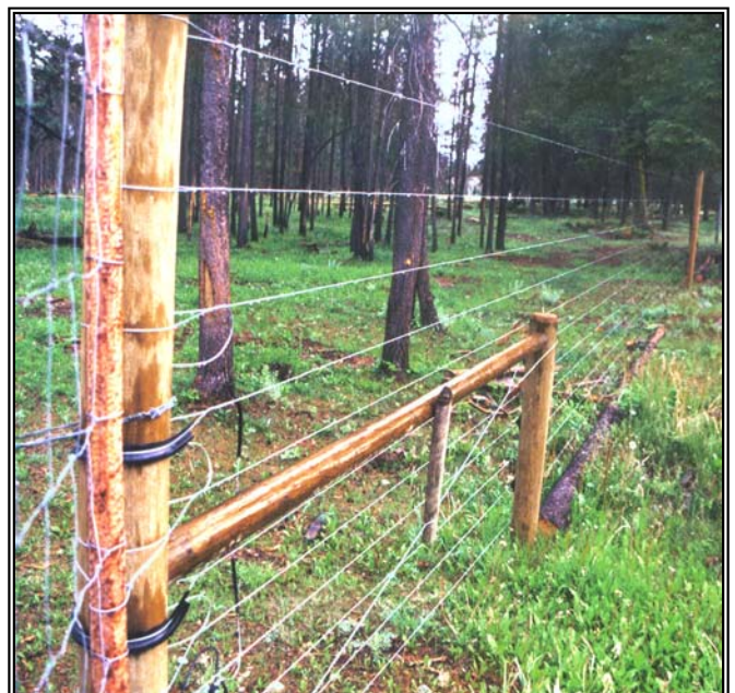
Figure 2 Typical 'Modified H' End Brace for Electric Elk Fence

Corner Braces: For 90° corners, use a brace of three driven posts and two rails. (Optional if the wires are being tied off – build two separate end braces of 4 driven posts and 2 rails).